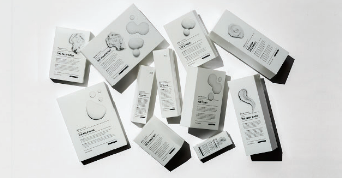
Shift from plastic cases to environmentally-friendly paper packaging to strengthen initiatives towards sustainability

2. Already expanded to more than 10 countries, and awarded as an international brand