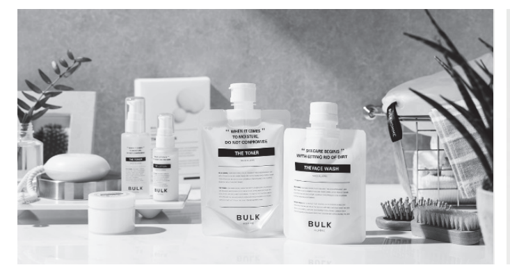
Package design that not only pursues novelty but also surely realizes safety and reliability, while also emphasizing the quality of bulk (content) itself

1. Renowned for its high-quality Japan-made products which contains ingredients that increase moisturizing balance and enhance radiant skin, as well as for monotone containers with a simple and unified design